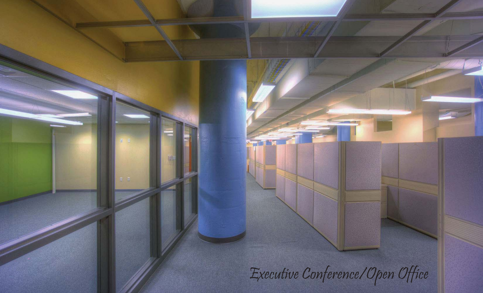
Executive Conference/Open Office