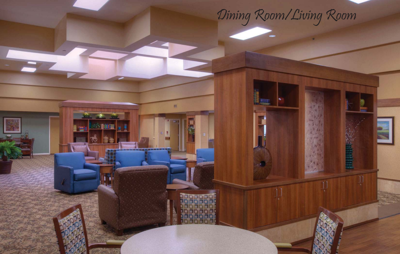
Dining Room/Living Room